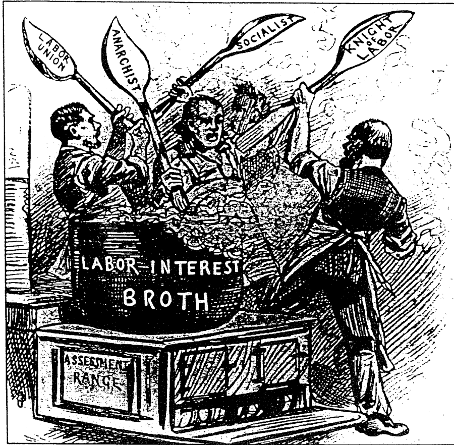
TOO MANY COOKS SPOIL THE BROTH.