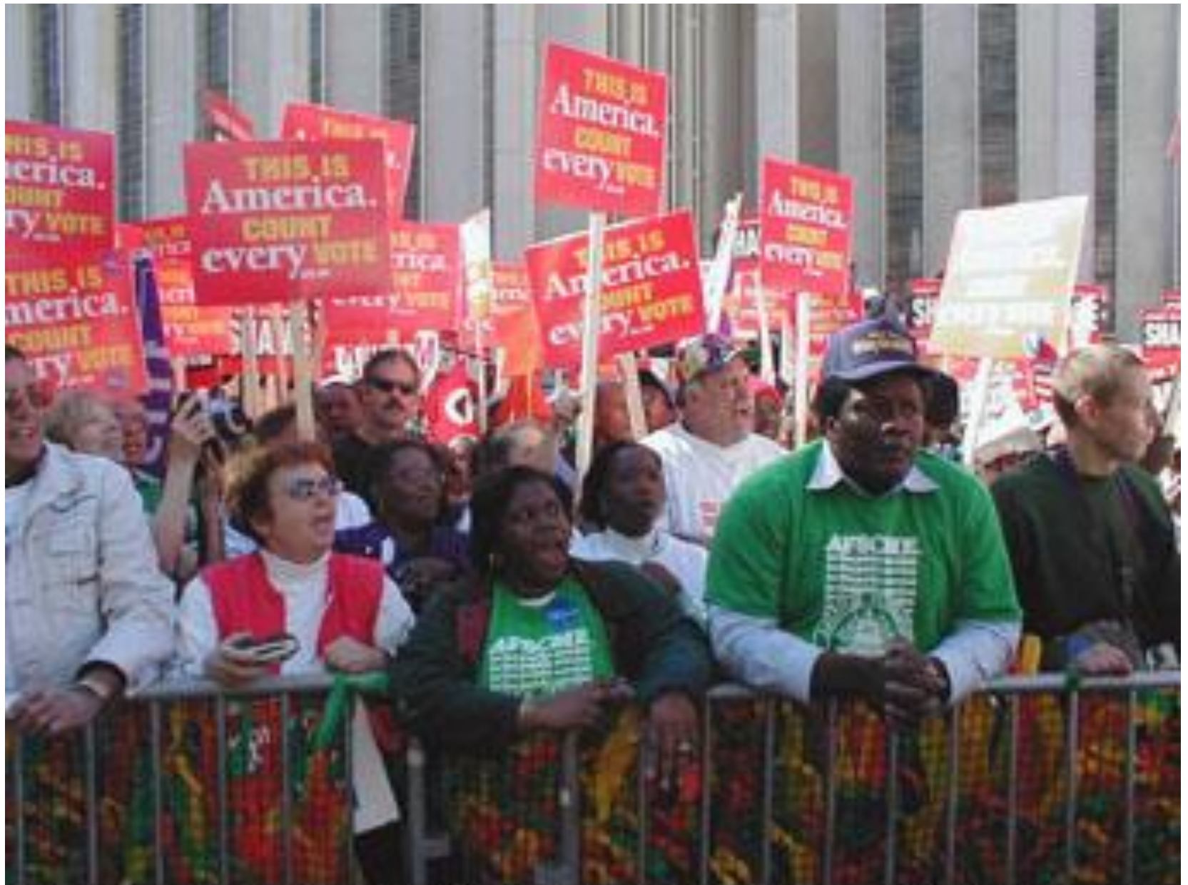
Rally at the state capitol in Tallahassee, Florida on Wednesday